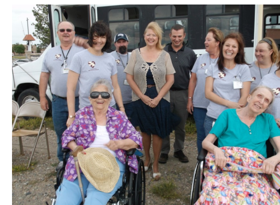
Residents and staff are all smiles wait- ing for the official Ground Breaking